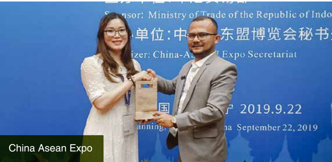
China Asean Expo